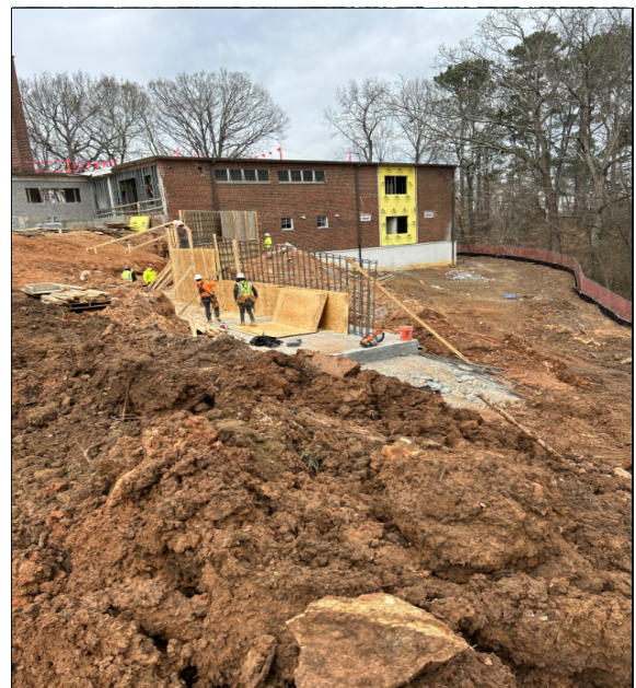
Continue constructing retaining walls