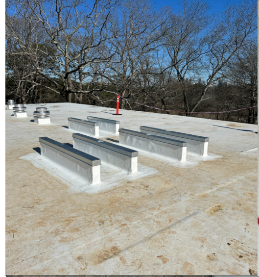
Continue installing roof rail curbs