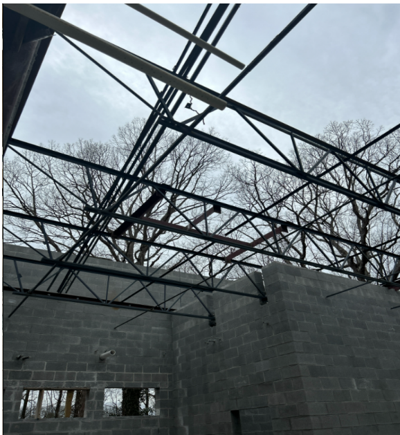
Continue to install joist and deck at the new kitchen addition