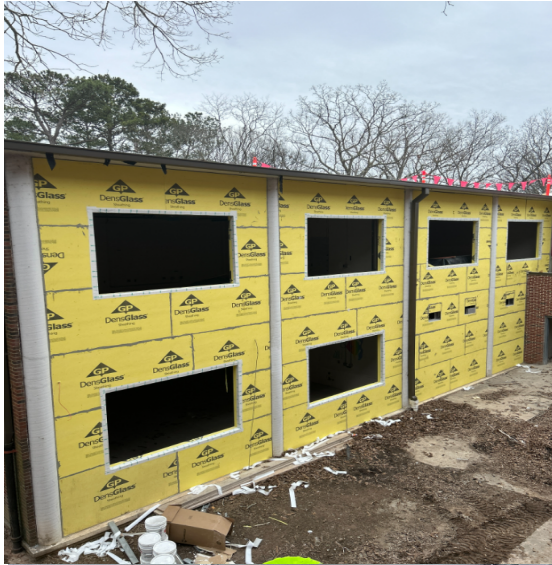
Began waterproofing at the 1958 building